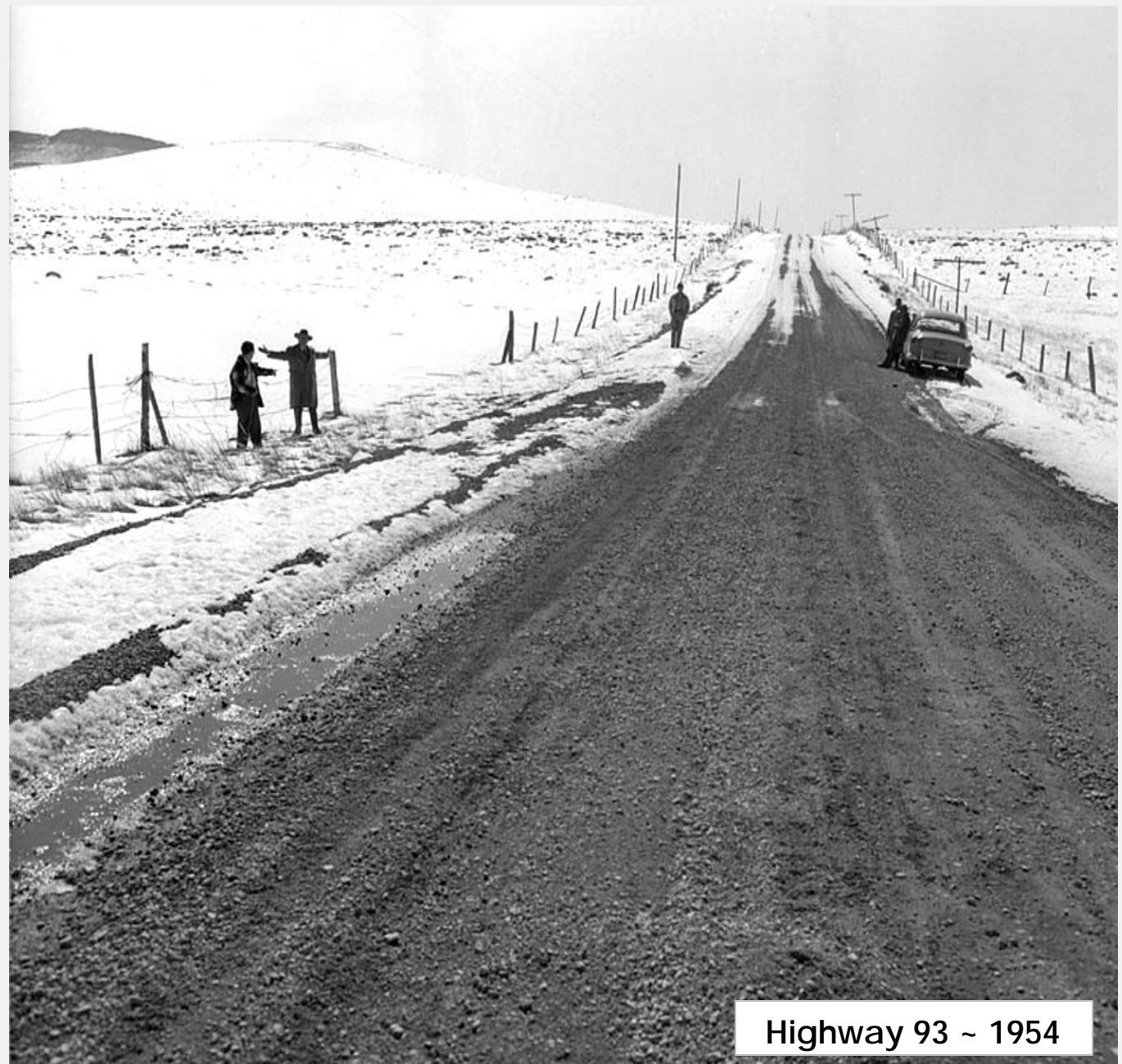
Highway 93 ~ 1954

Rocky Flats Stewardship Council has met its mission ~ great success story